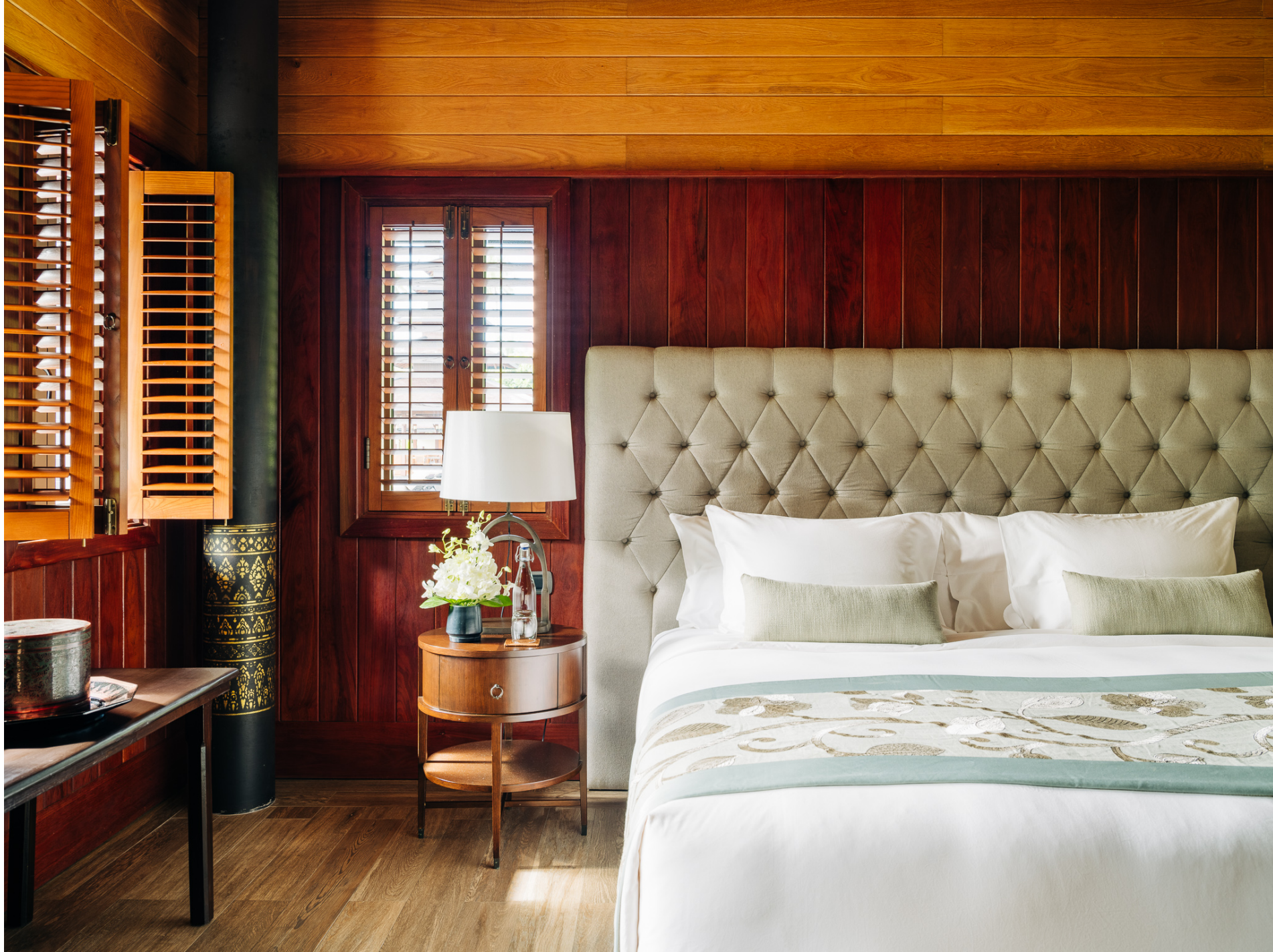
FAMILY VILLA 980 SQ.FT / 91 SQ.M

Situated behind the Ocean Villas and ideal for younger family members, the two free-standing Family Villas each offer two guestrooms on either side of a shared living area with TV, sofa, and writing desk.