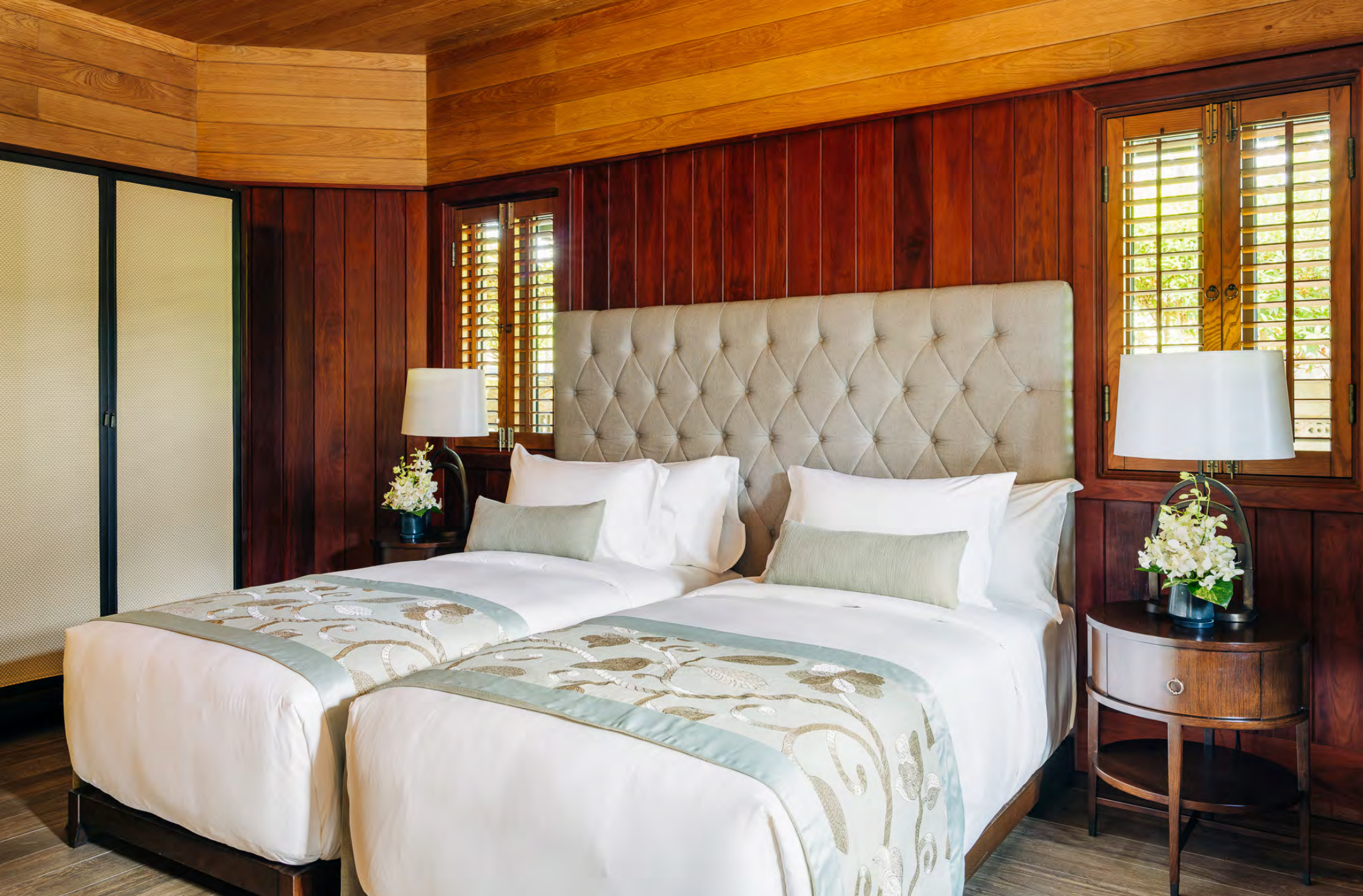
FAMILY VILLA 980 SQ.FT / 91 SQ.M

Situated behind the Ocean Villas and ideal for younger family members, the two free-standing Family Villas each offer two guestrooms on either side of a shared living area with TV, sofa, and writing desk.