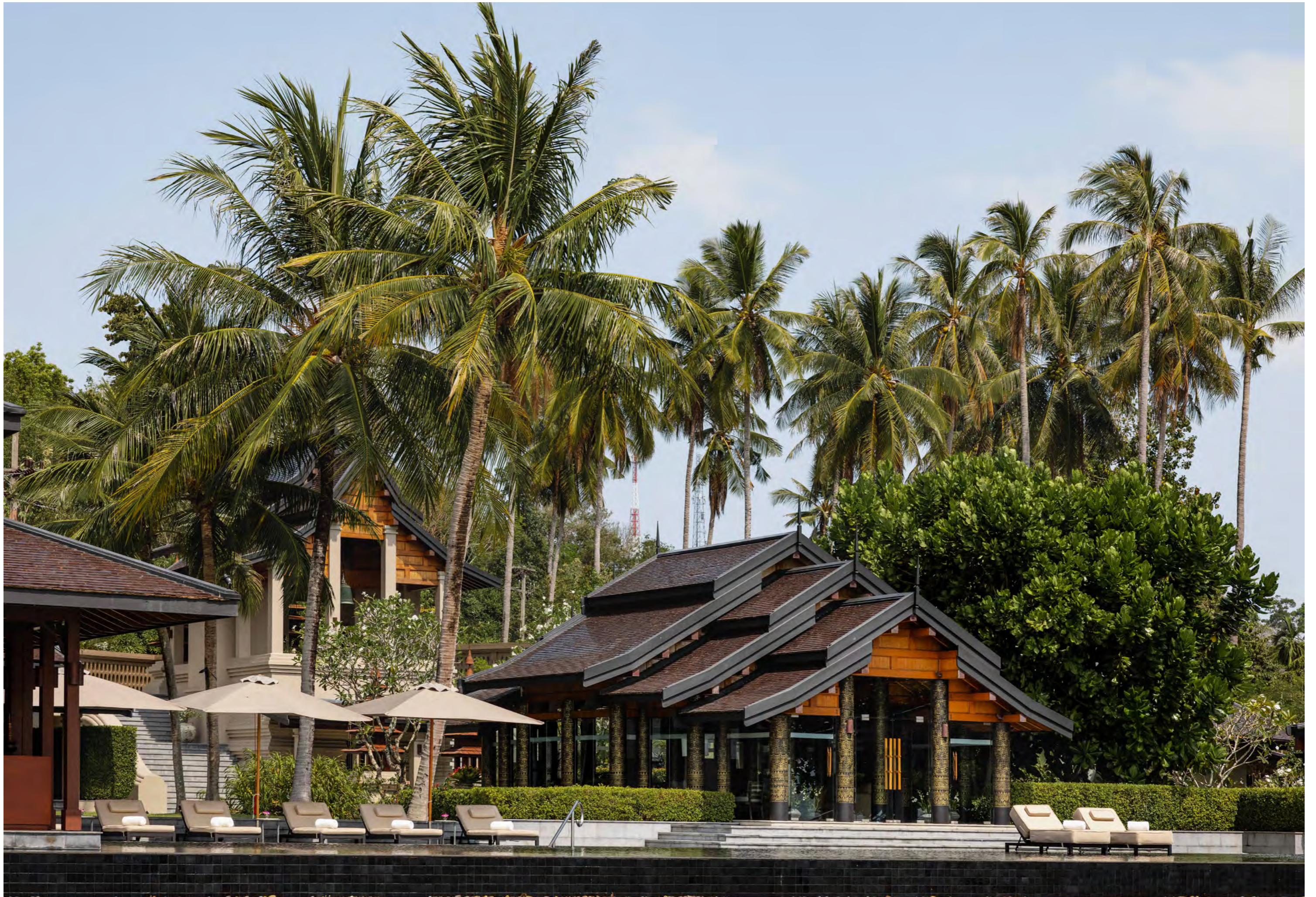
ANI THAILAND - LIVING SALA