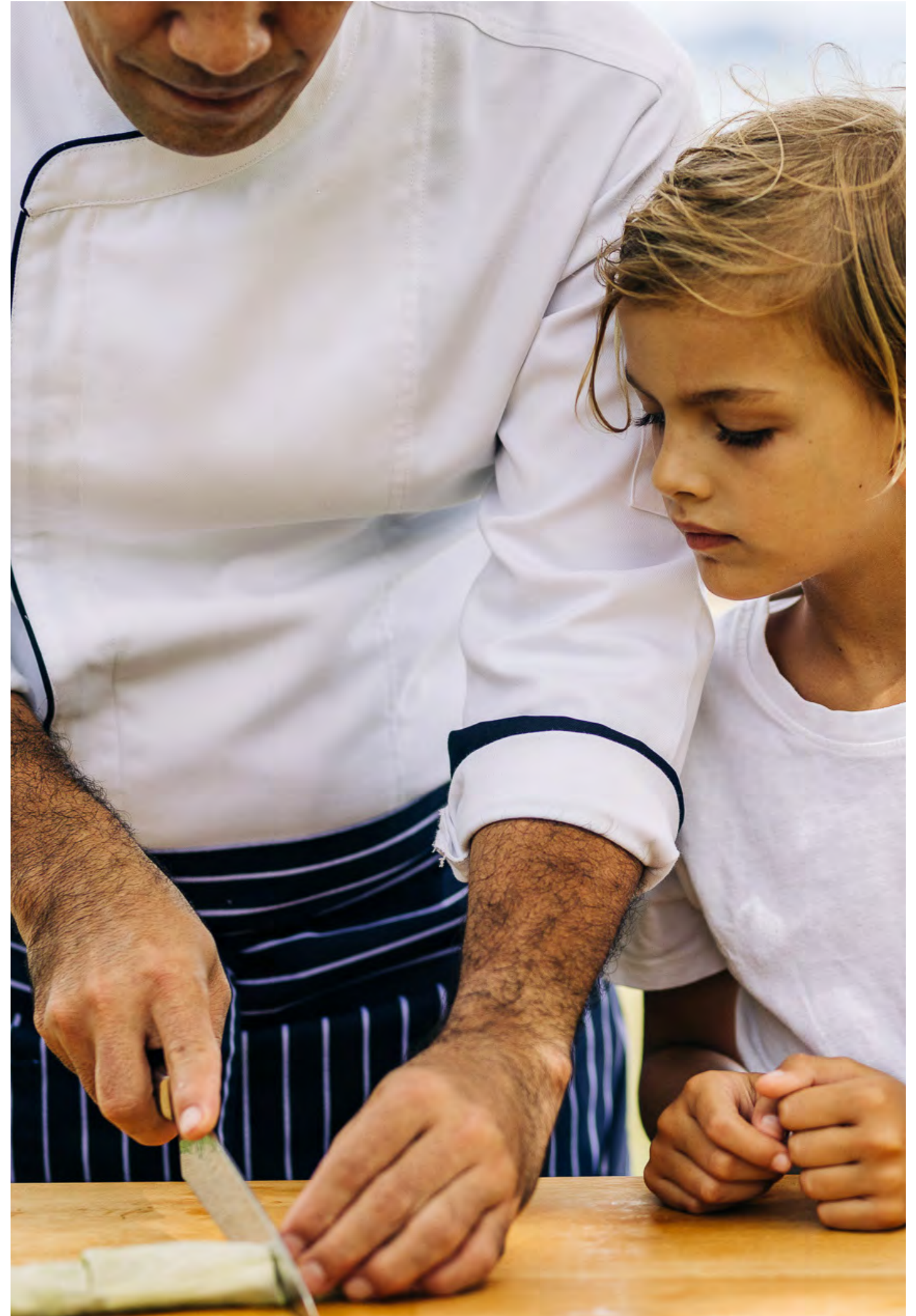
ANI THAILAND - GUEST PRIVILEGES - BATIK PAINTING & COOKING CLASSES