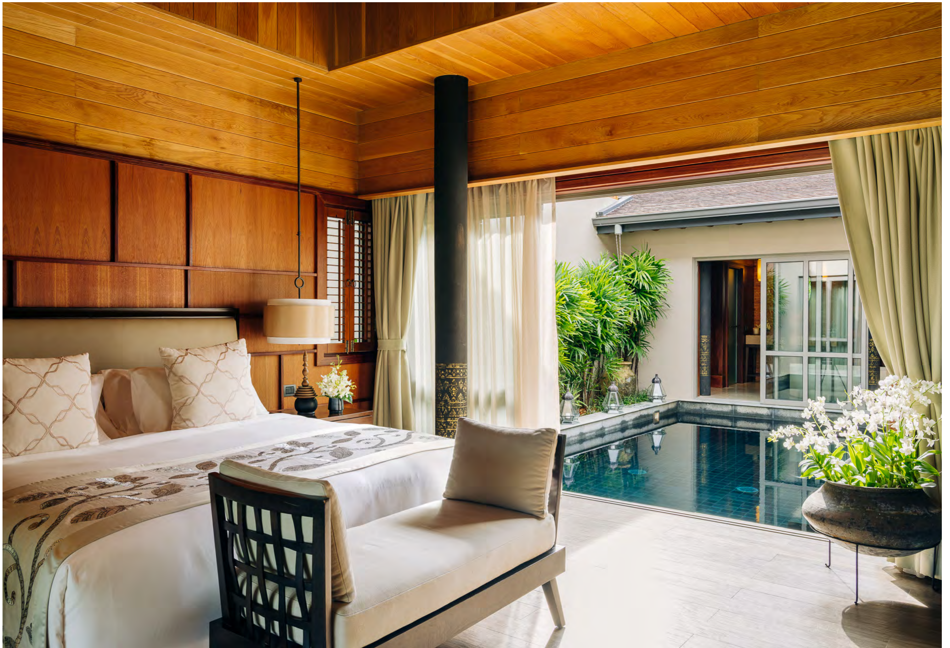
ANI THAILAND - POOL SUITE