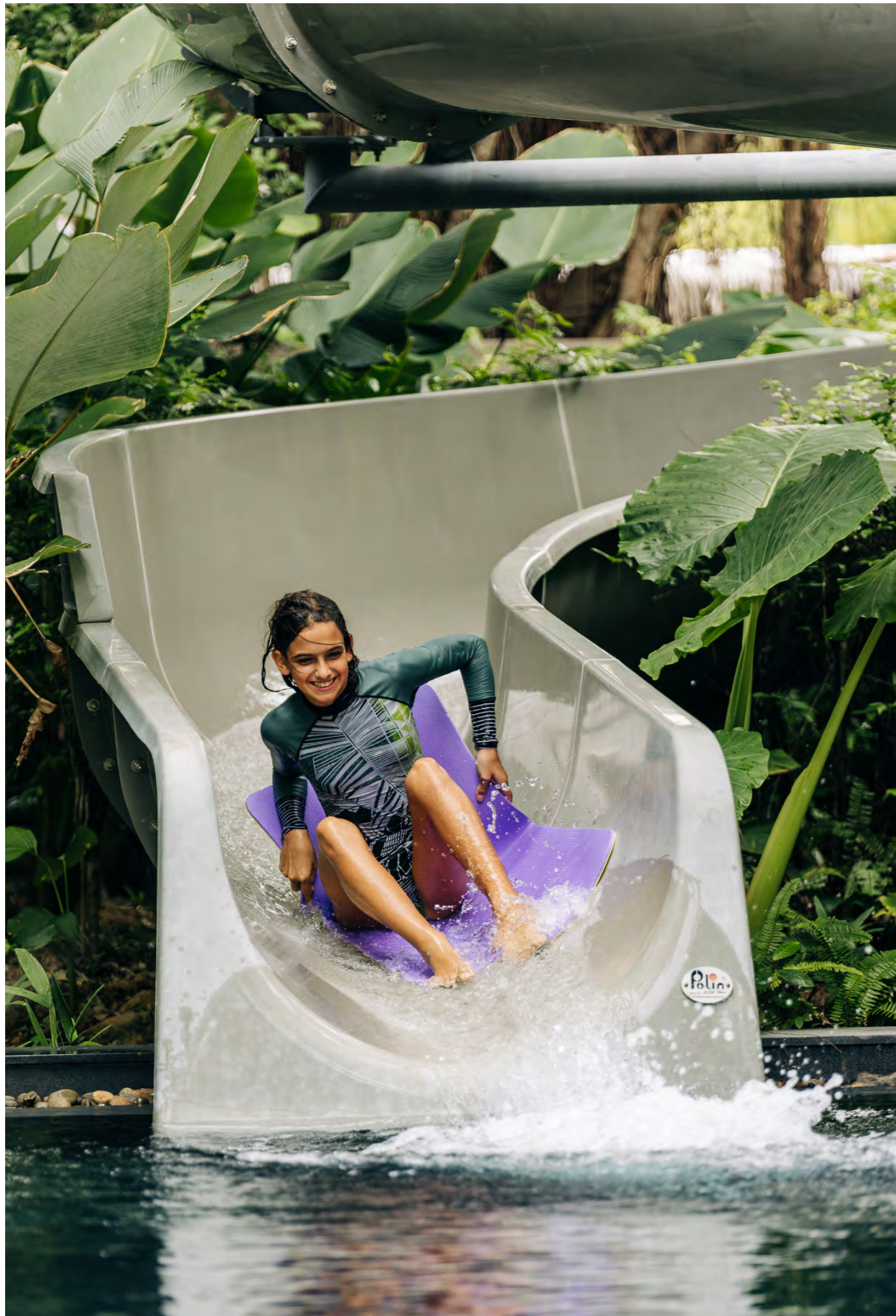
ÀNI THAILAND - GUEST PRIVILEGES - MUAY THAI BOXING & WATERSLIDE