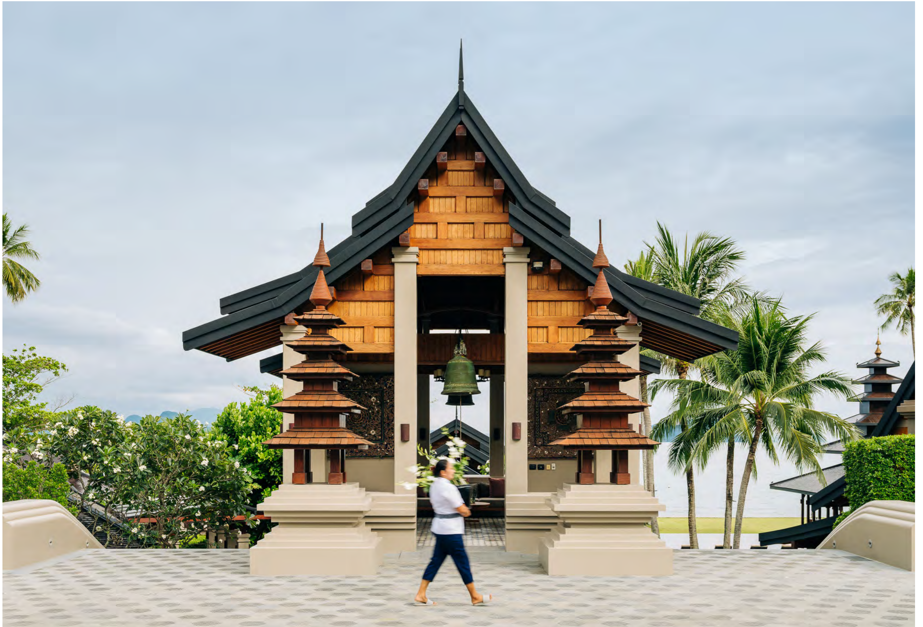
ANI THAILAND - ARRIVAL PAVILION