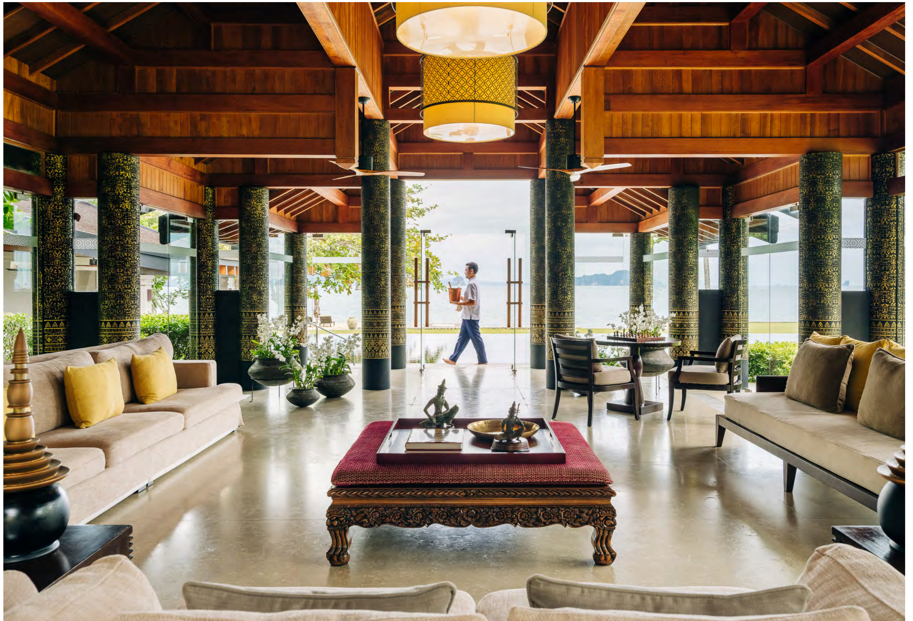
ANI THAILAND - LIVING SALA