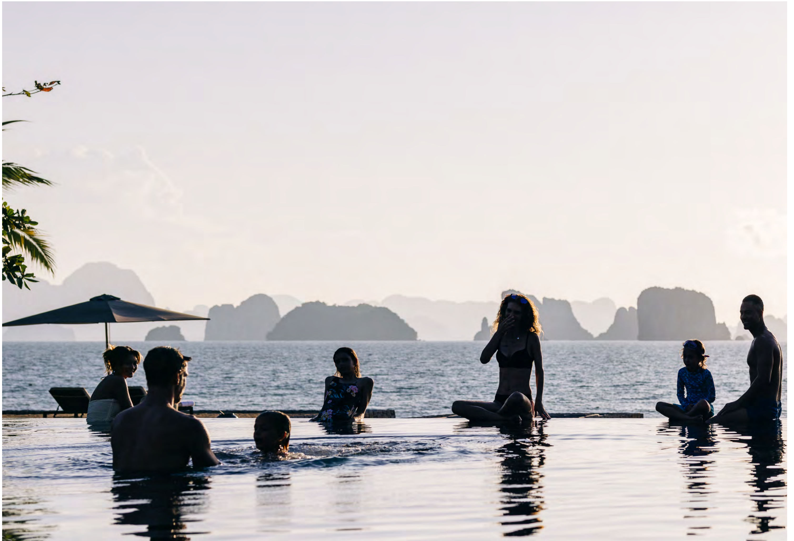
ANI THAILAND - POOL WITH VIEWS OVER PHANG NA BAY