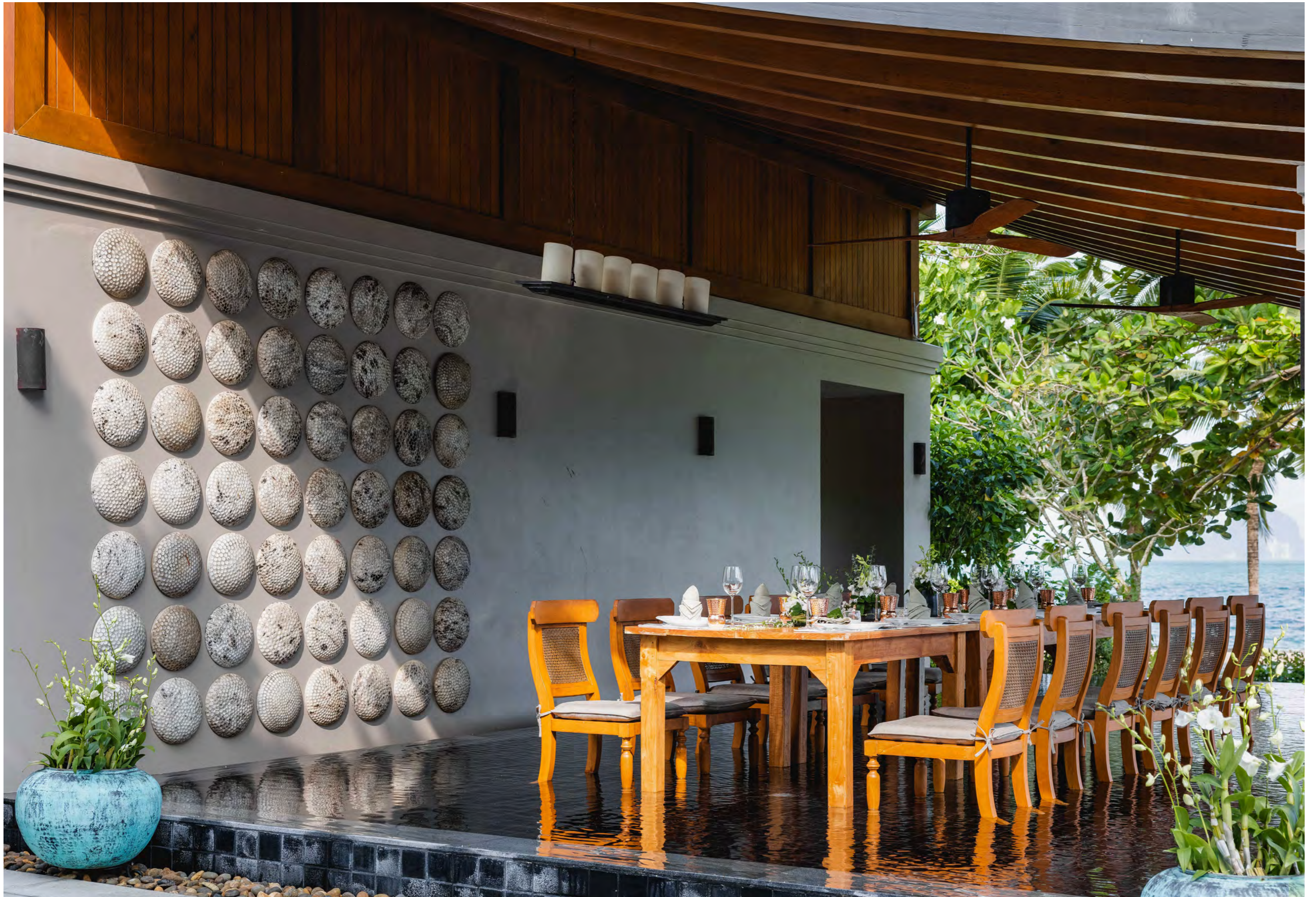
ANI THAILAND - BAREFOOT LUNCH