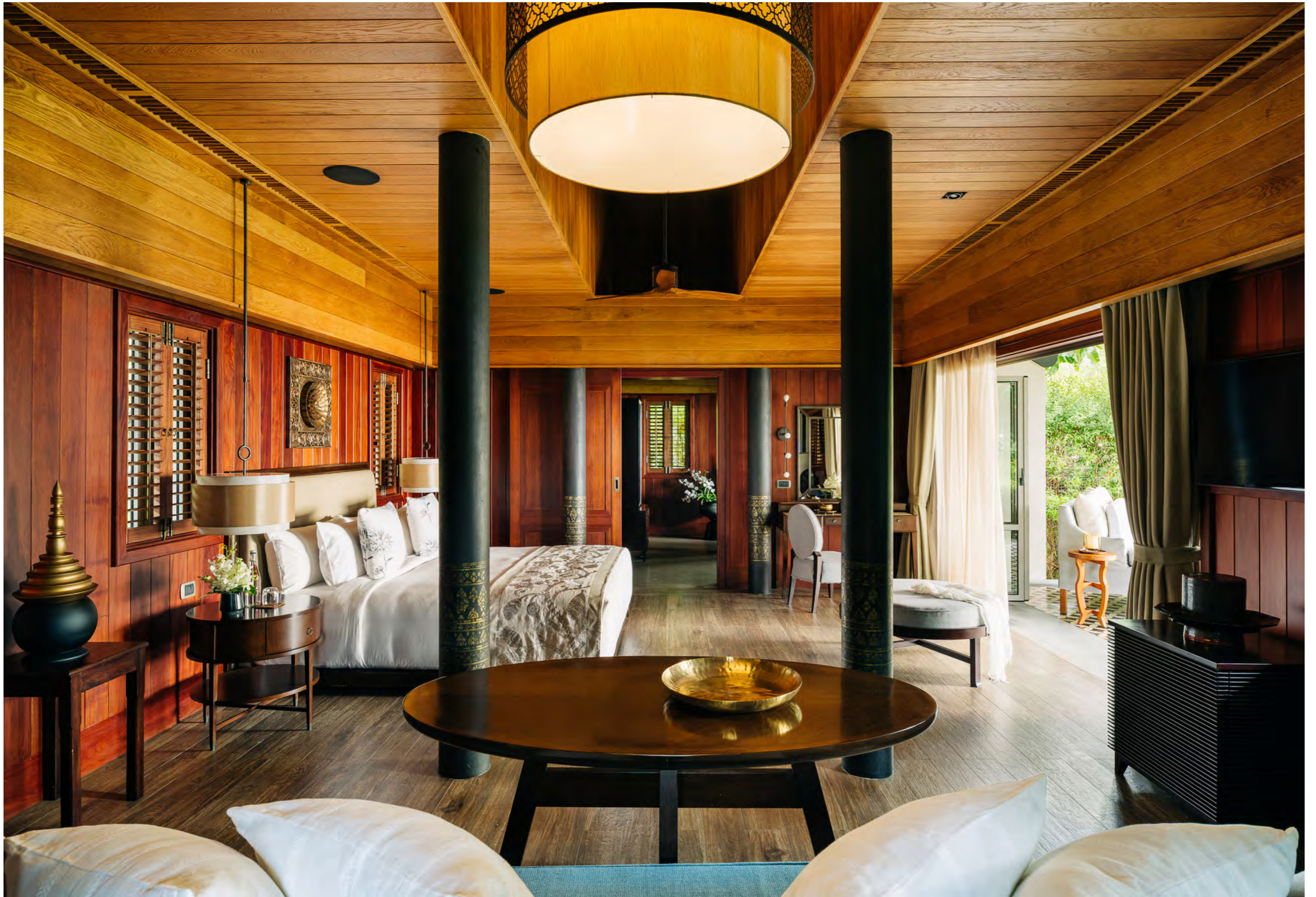
ANI THAILAND - OCEAN VILLA