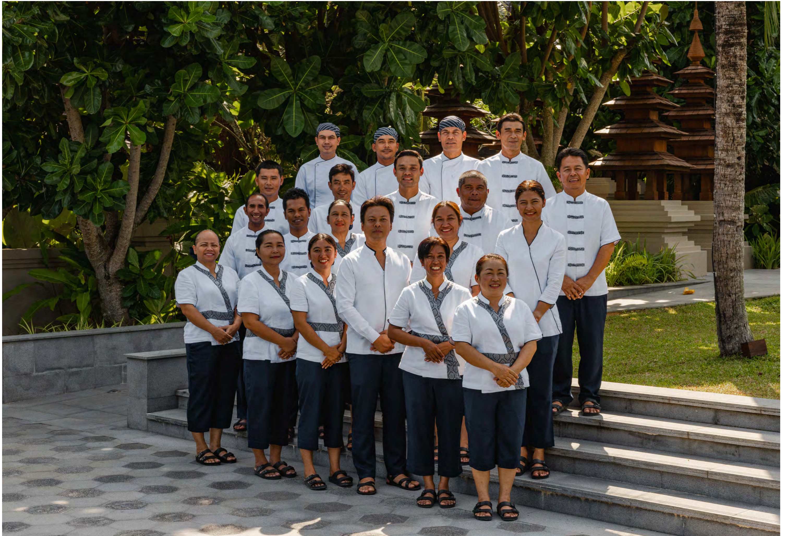
ANI THAILAND - YOUR TEAM