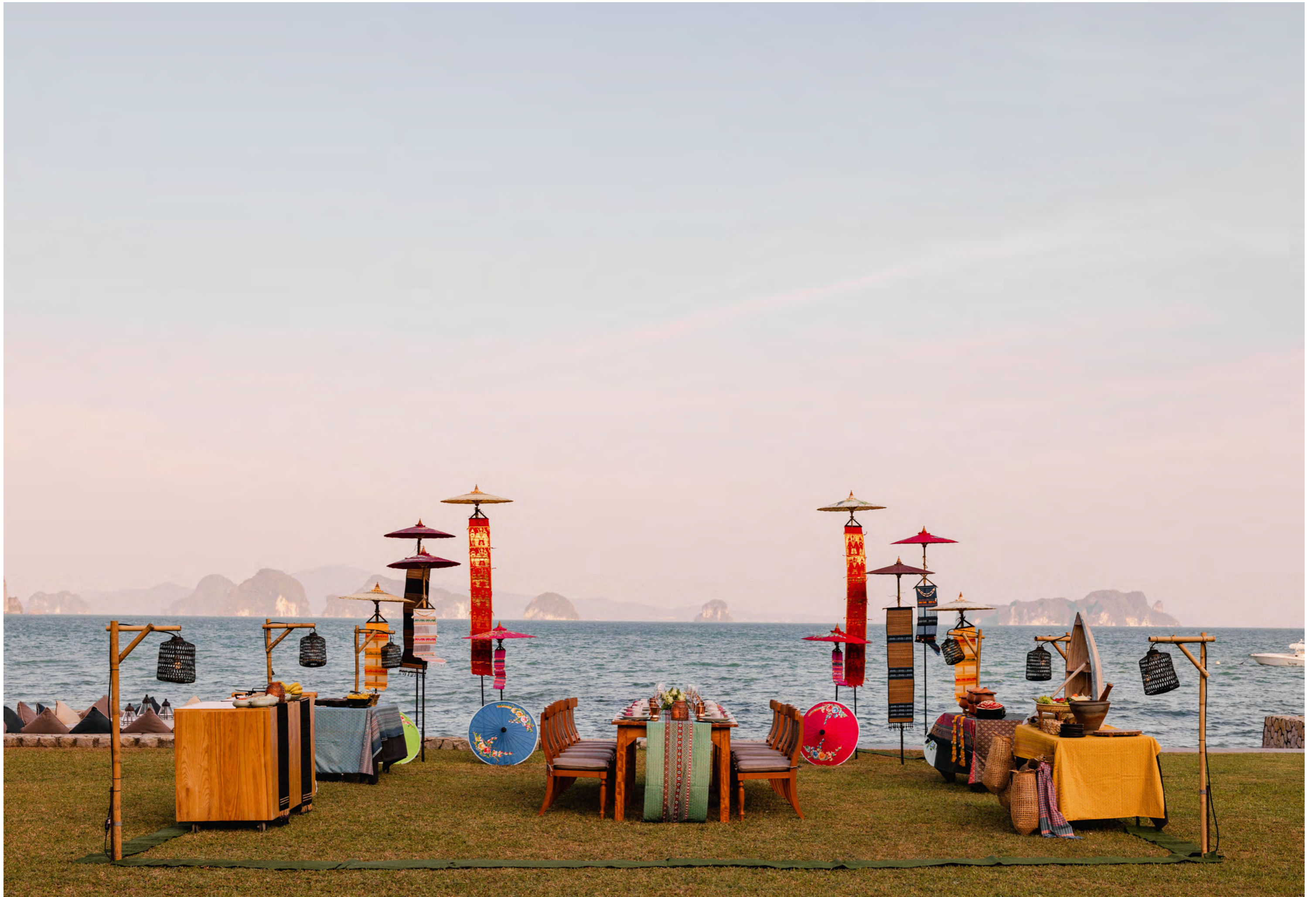
ANI THAILAND - THAI MARKET DINNER