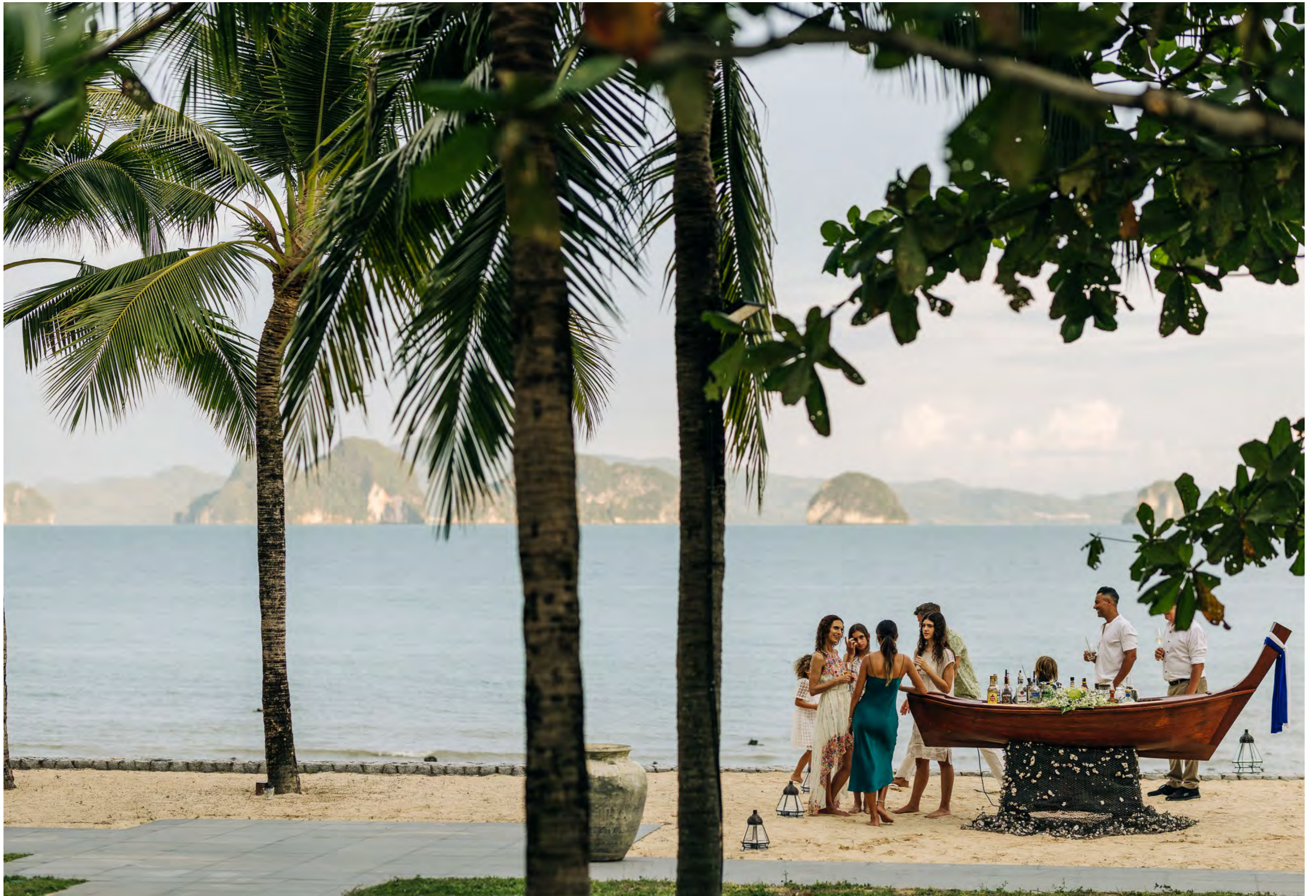
ANI THAILAND - PRE-DINER DRINKS