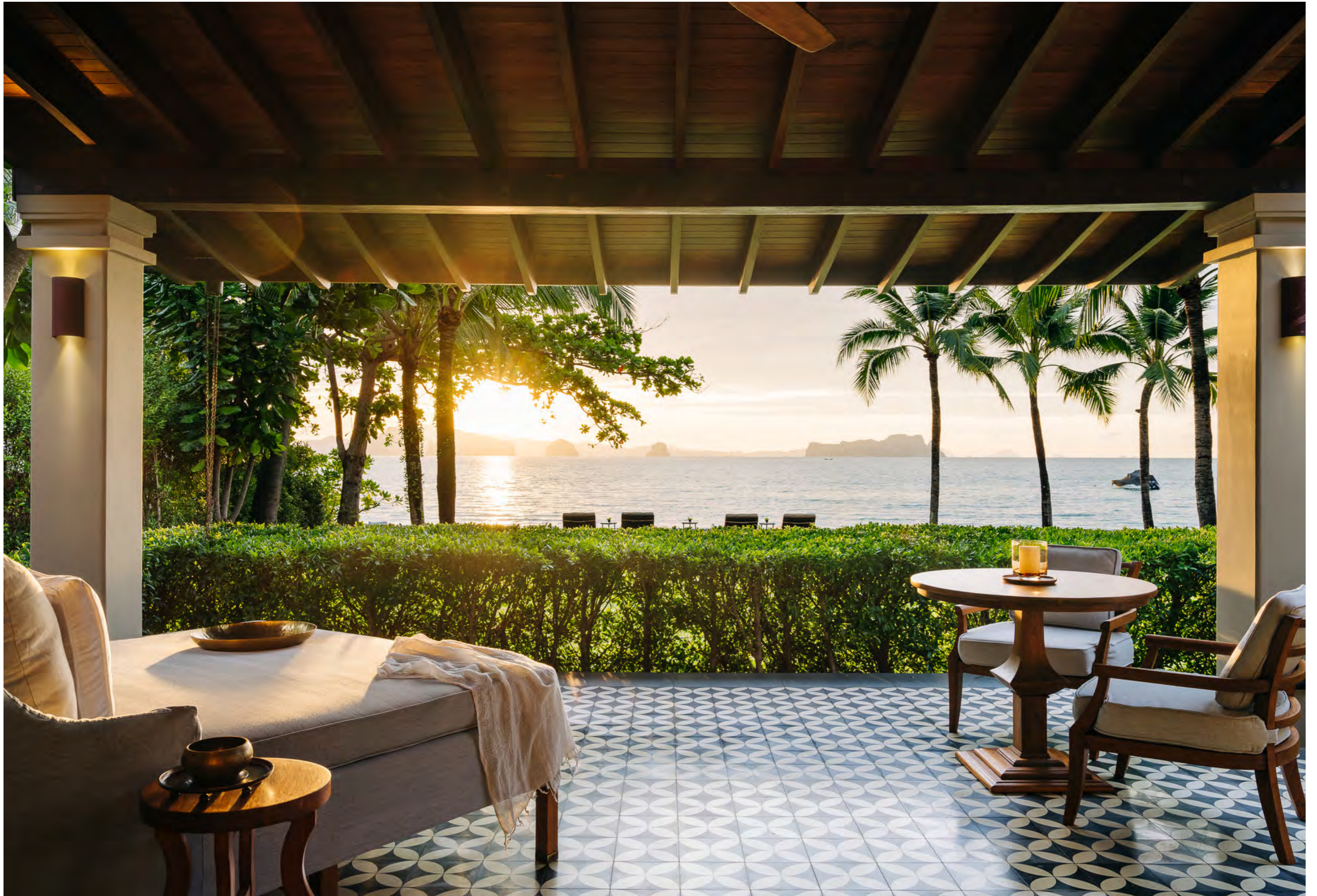
ANI THAILAND - OCEAN VILLA TERRACE