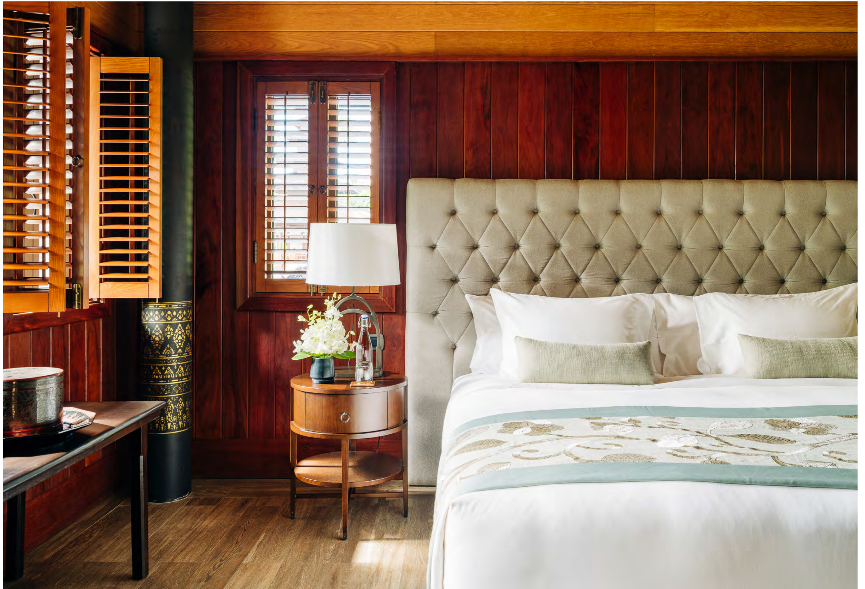
ANI THAILAND - FAMILY VILLA