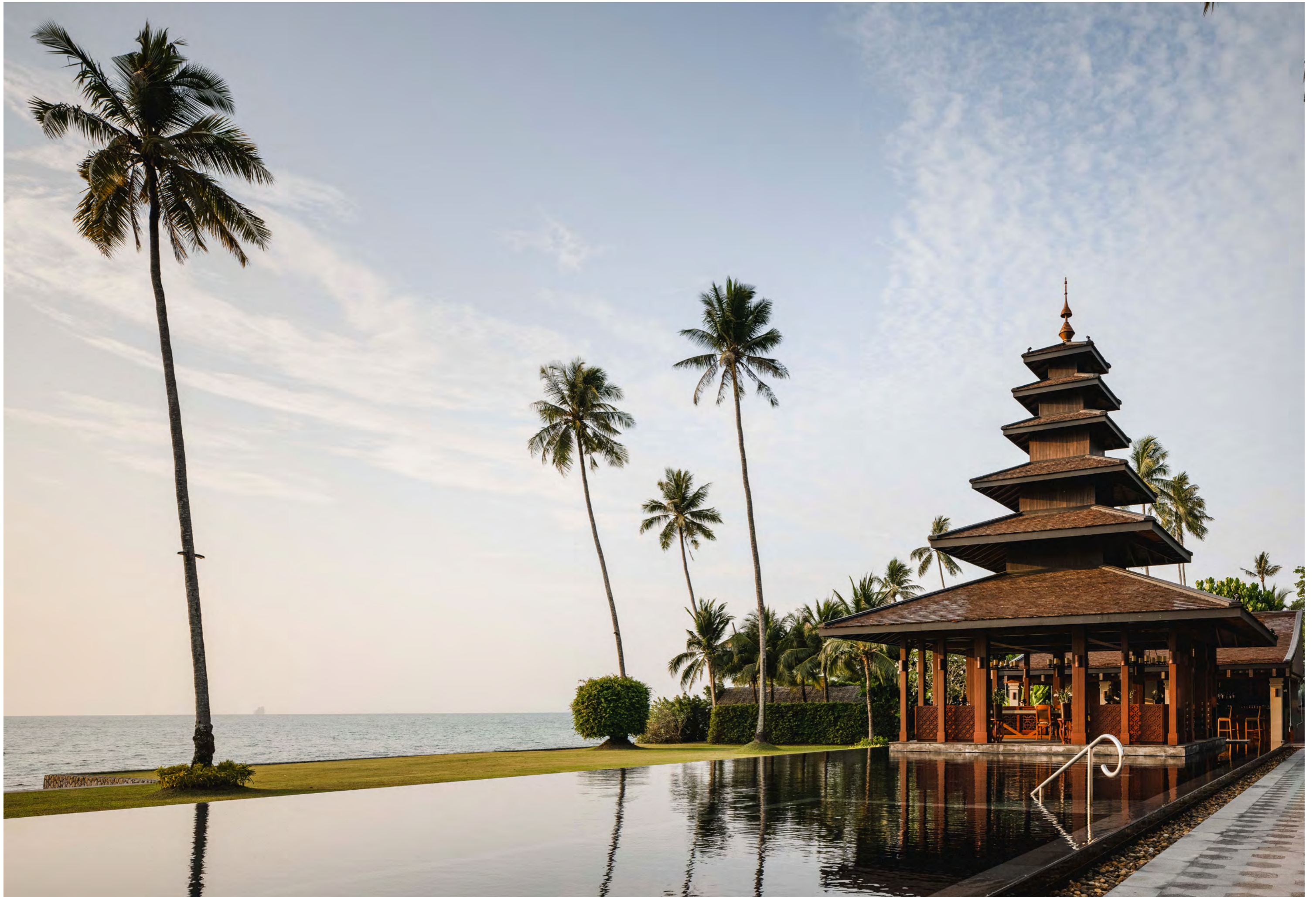
ANI THAILAND - DINING PAVILION & 42 METRE POOL