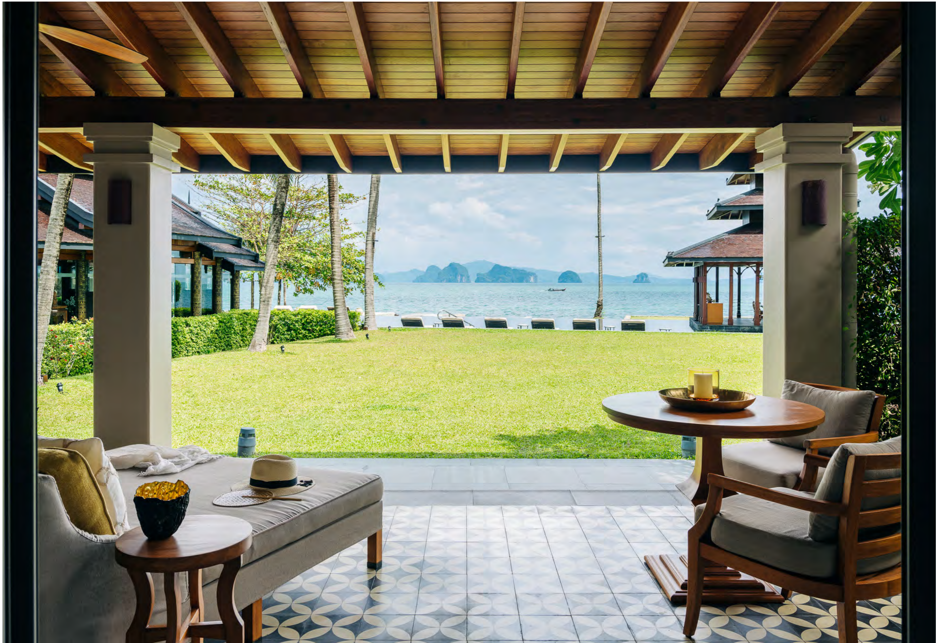
ANÏ THAILAND - POOL SUITE TERRACE