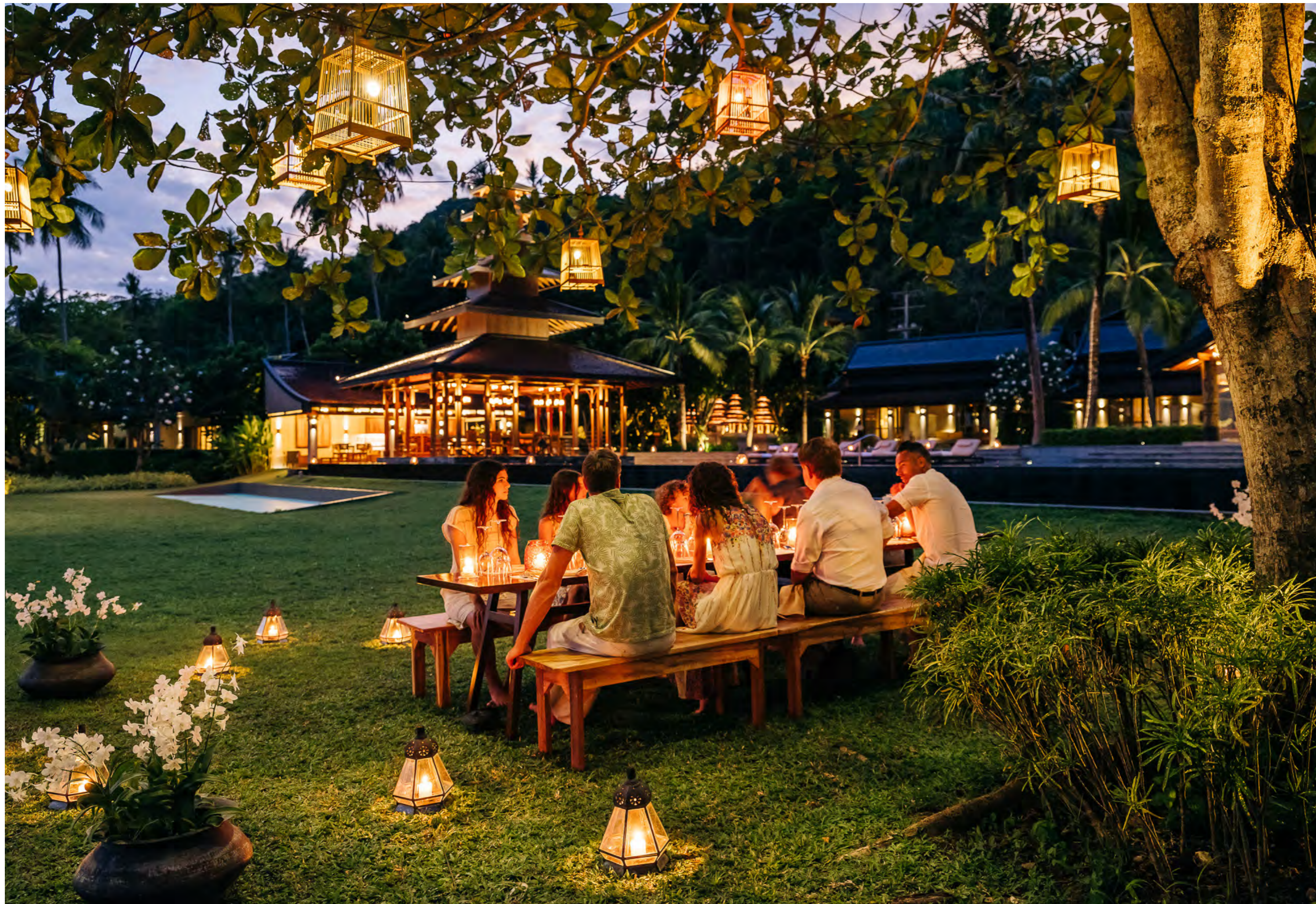
ANI THAILAND - GARDEN DINNER