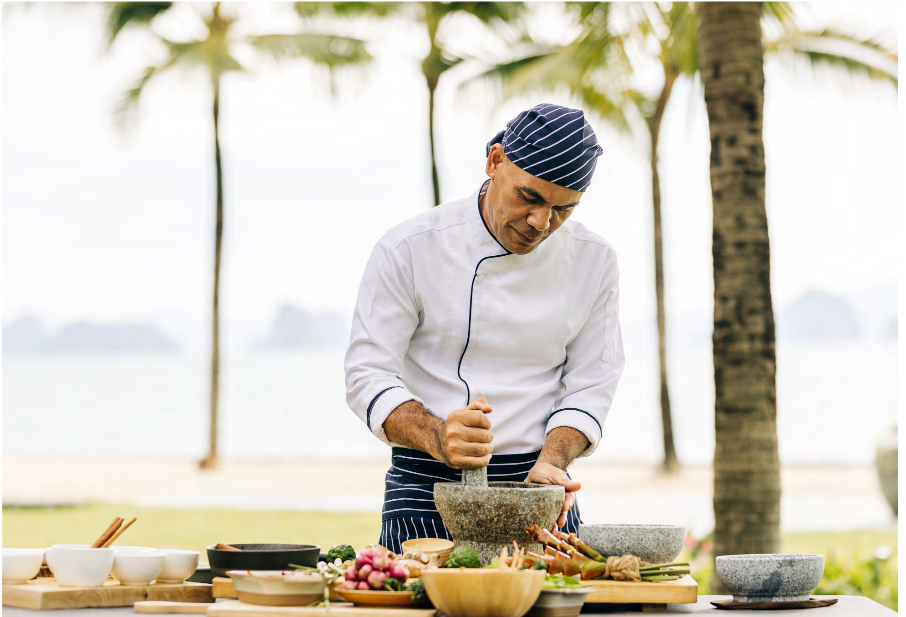
ANI THAILAND - PRIVATE CHEF