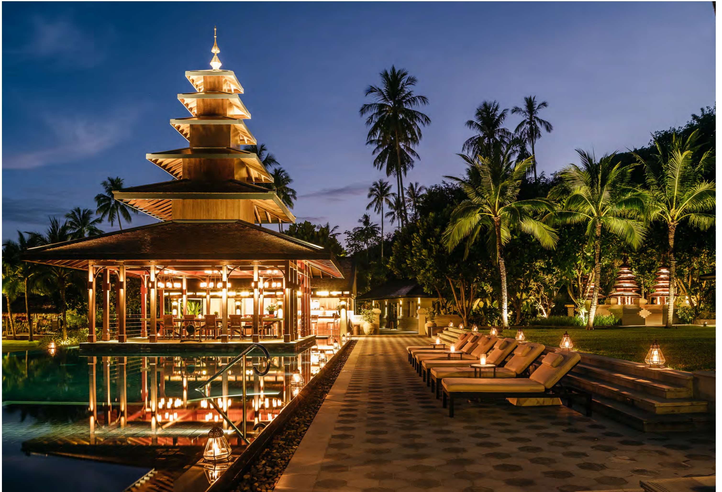
ANI THAILAND - DINING PAVILION