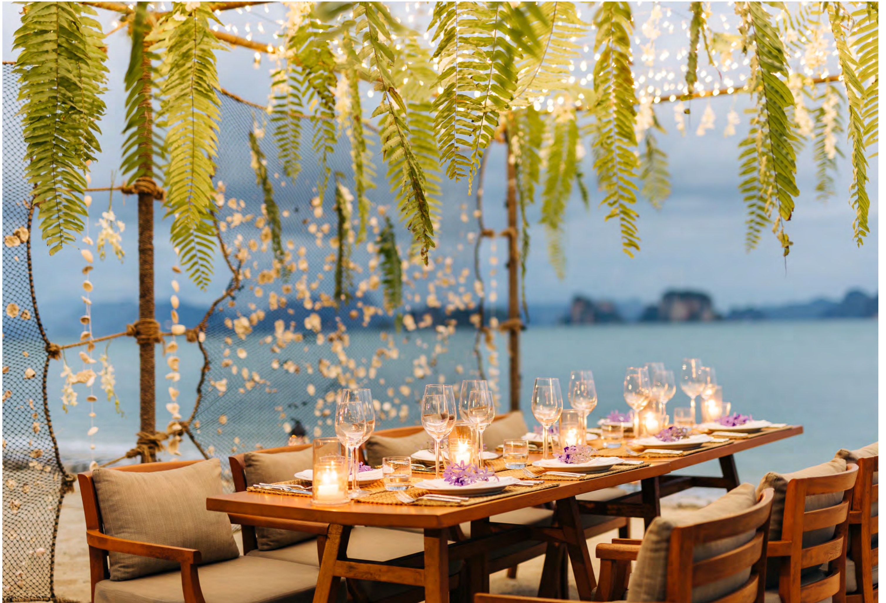
ANI THAILAND - BEACH DINNER