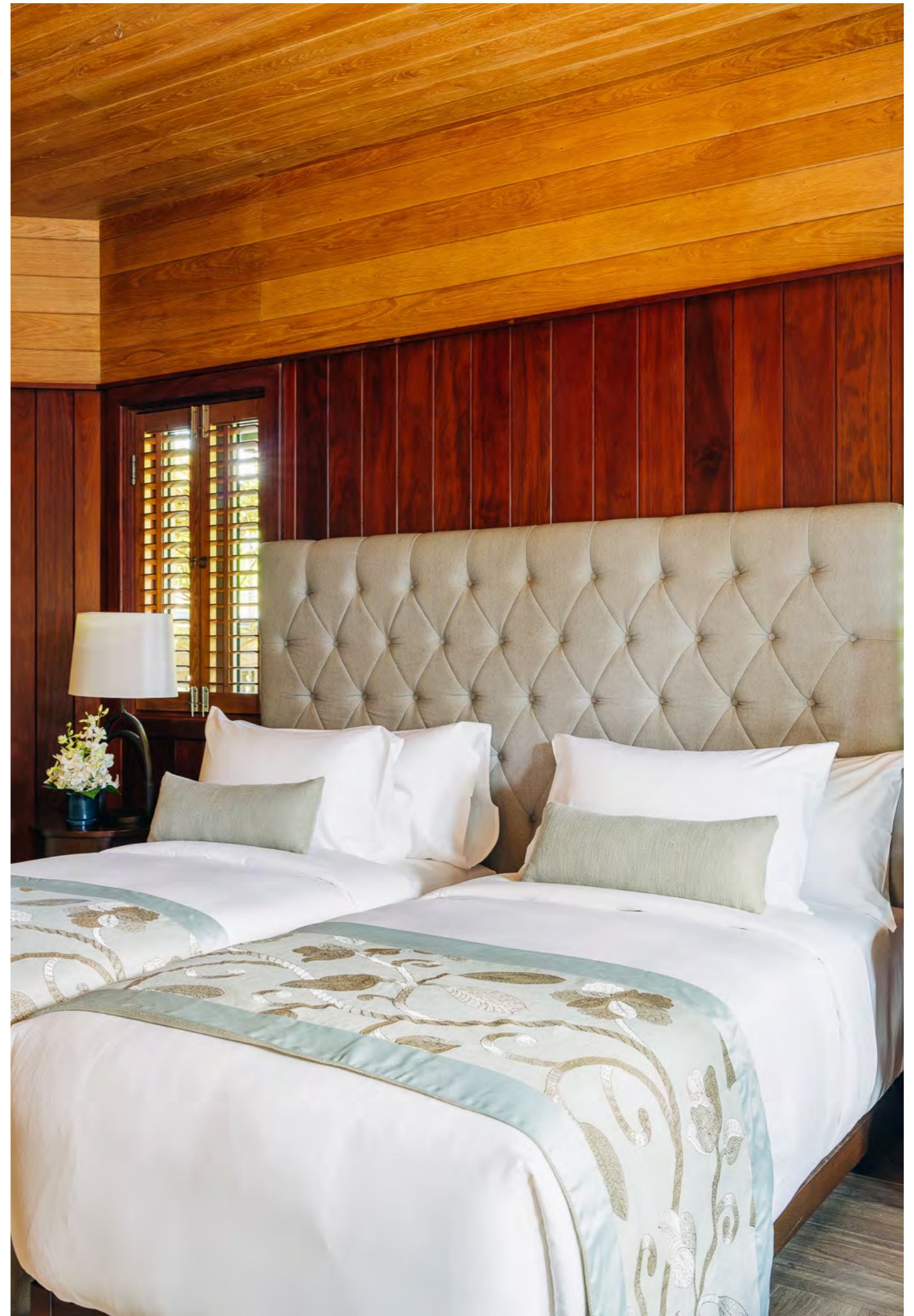
ANI THAILAND - FAMILY VILLA