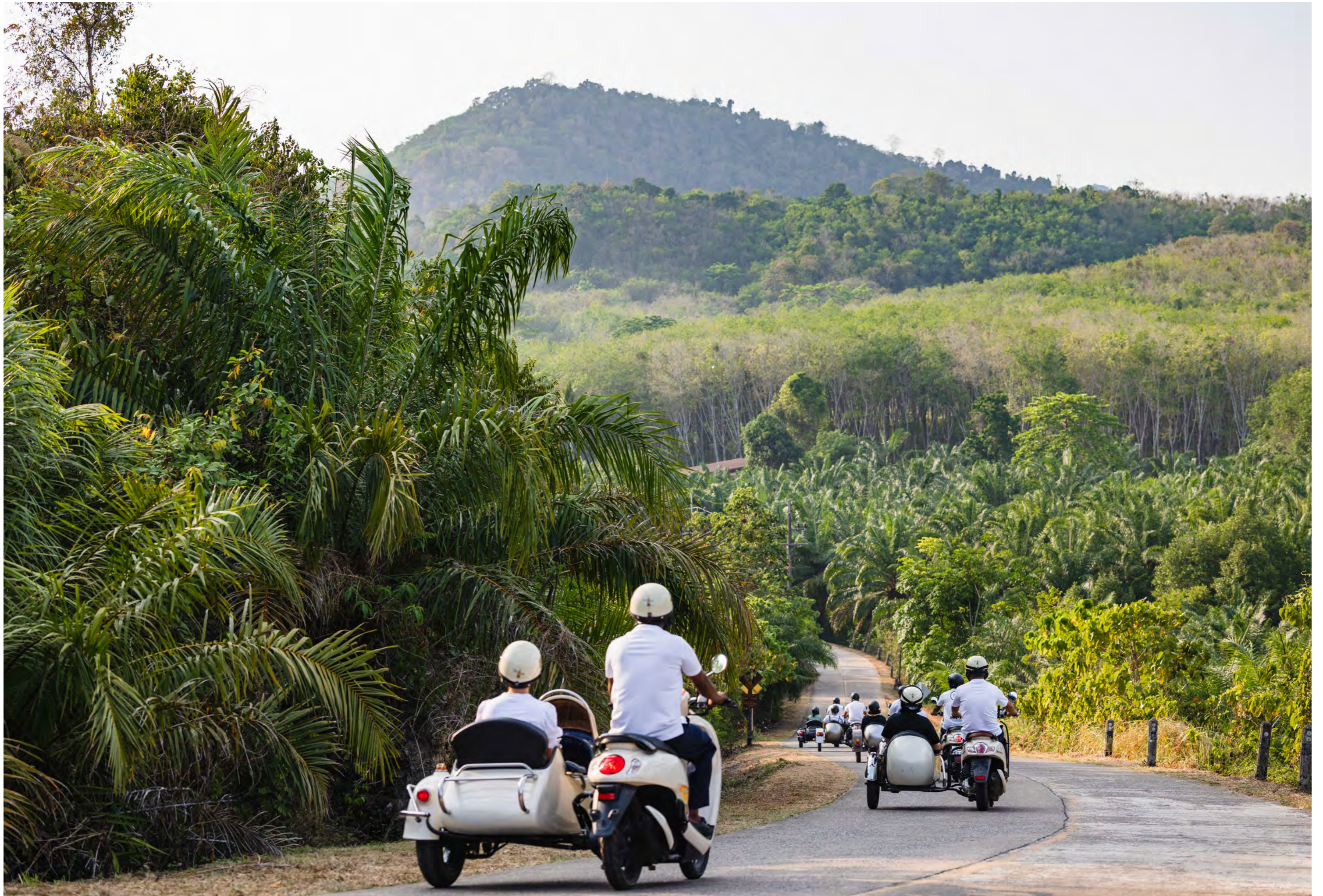
ANI THAILAND - GUEST PRIVILEGES - SIDE CAR ADVENTURE