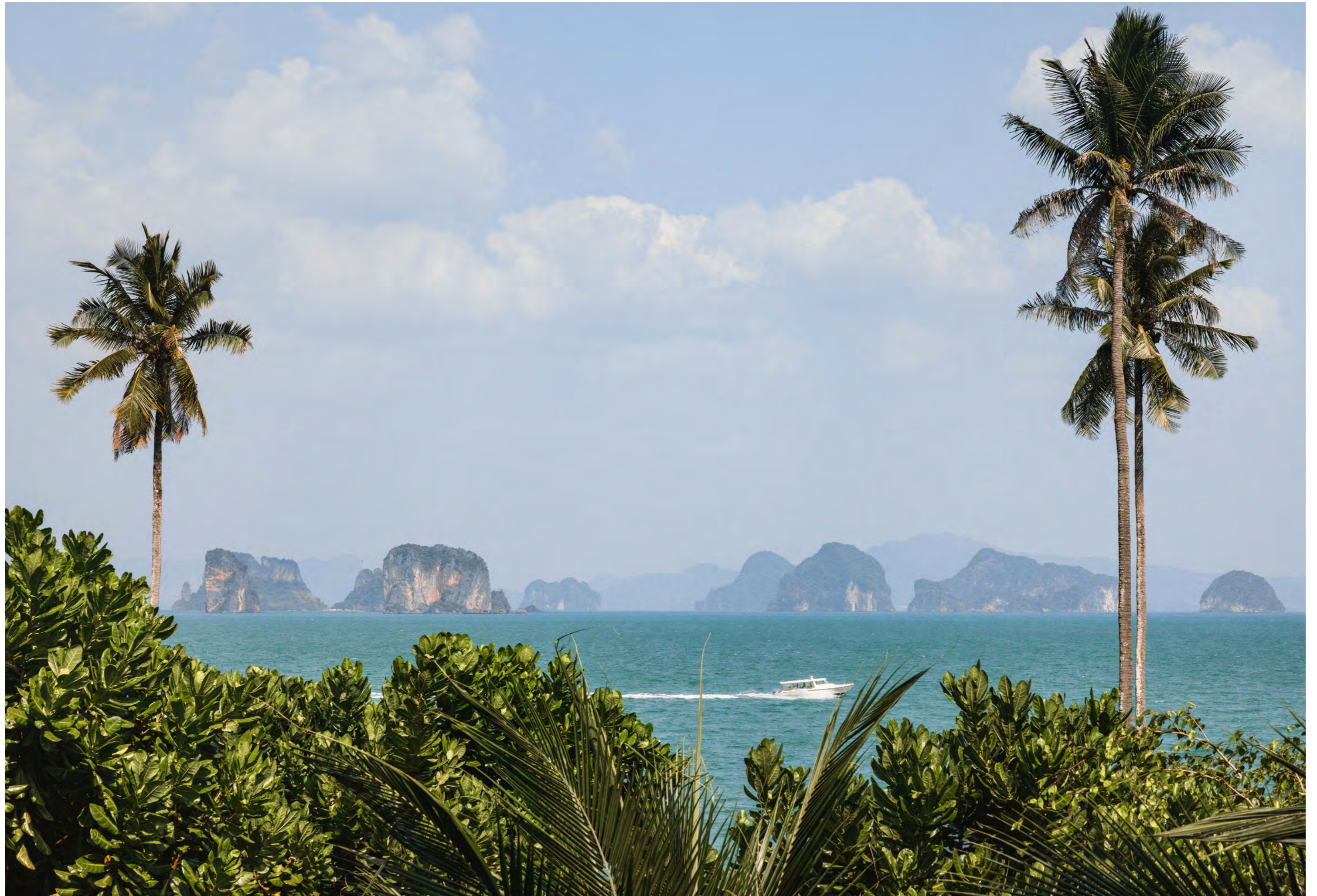
ÀNI THAILAND - PHANG NA BAY