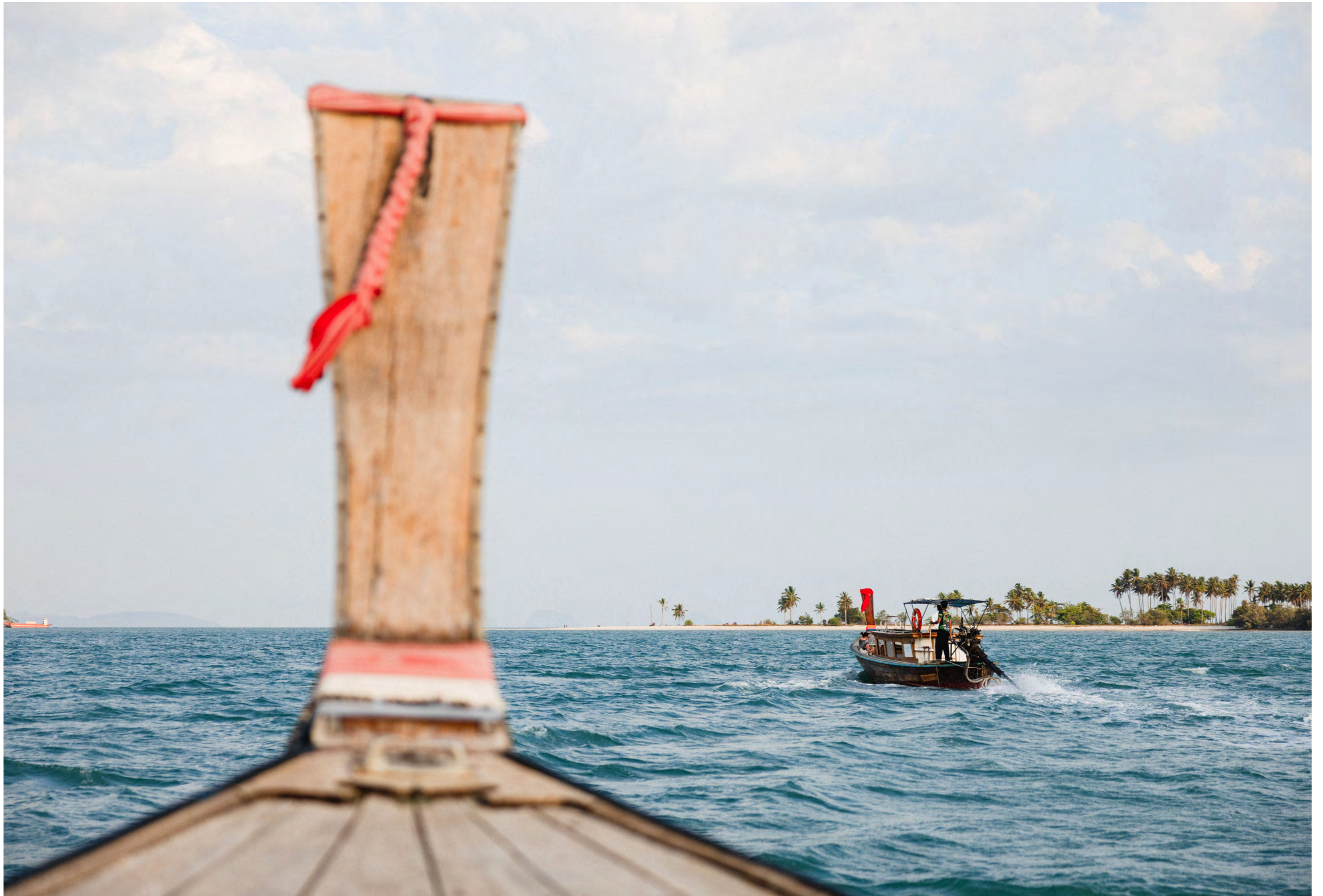
ANI THAILAND - GUEST PRIVILEGES - SUNSET CRUISE